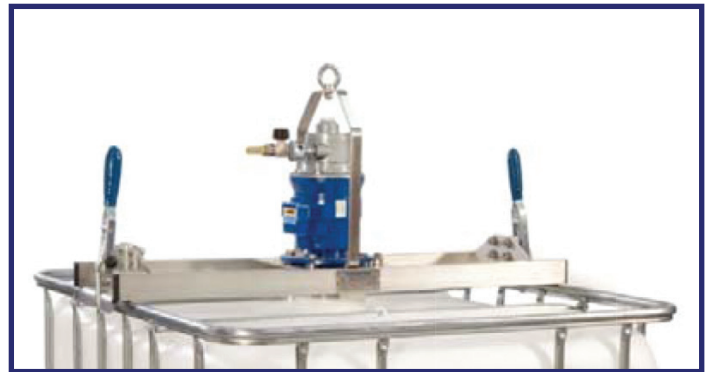
Air Drive with Standard Frame