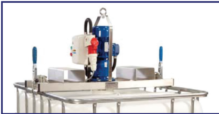
Electric Drive with Fork Lift Frame

Mounting for the IBC mixer drive is on a lightweight stainless steel bridge for ease of handling which locates directly onto the IBC and is held in place with quick action toggle clamps.