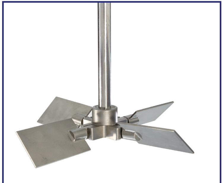
E-400 Folding impeller operating